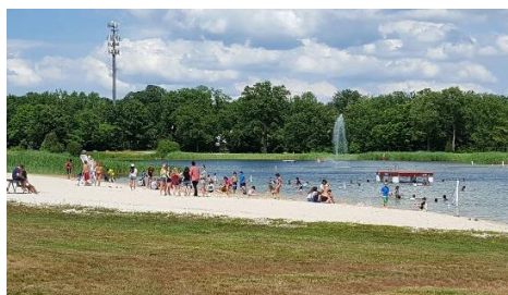
Crestwood Lake / Park Camp STEAM Lakeside 388 West Crescent Avenue