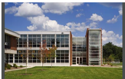
NHRHS Science Building Camp STEAM Home Base 298 Hillside Avenue

Summer Super Stars Camp STEAM 2017 facilities at Northern Highlands Regional High School (NHRHS) and Crestwood Park, in Allendale, New Jersey: